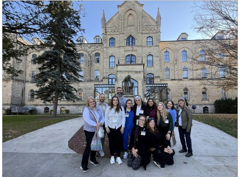
Associates of St. Paul Elder Services complete a mission tour at the Motherhouse of the Franciscan Sisters of Christian Charity. This is a great opportunity for all our associates to get a deeper understanding of our history and who we are.

Our efforts towards the future have already been taking shape through