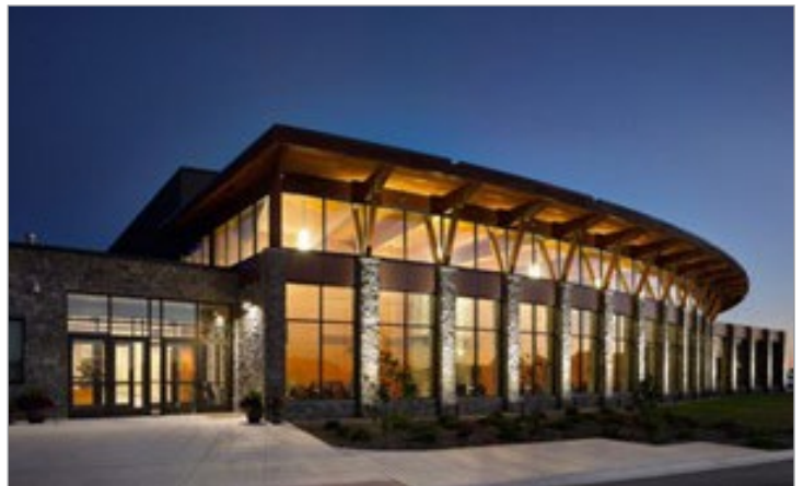
The Holy Family Conservatory in 1925 to the current Conservatory located within The Franciscan Center.