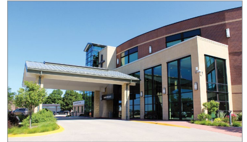
Pictured left to right are St. Joseph’s Home in 1950 and Franciscan Healthcare today.

As the ministry grew, so did its reach. In 1995, the healthcare system was renamed Franciscan Care Services, reflecting a broader vision of care. Just a few years later, beginning in 1998, satellite clinics emerged to better serve surrounding communities. Today, as Franciscan Healthcare, that commitment is visible across the region, with clinics in Scribner, Wisner, Oakland, and Howells, along with pharmacy sites, a daycare, and additional services designed to meet people where they are.