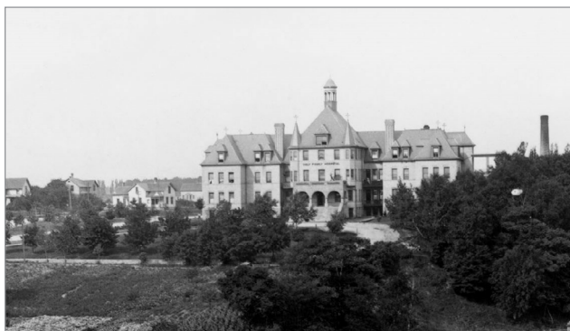
Pictured is the original Holy Family Hospital.

Undeterred by past challenges, the Sisters moved forward with remarkable courage and trust in Divine Providence. In April 1898, they purchased the former Gerpheide's Park, a scenic site overlooking the city, river, and harbor. Their vision became reality on September 28, 1899, when Holy Family Hospital was officially dedicated. This marked