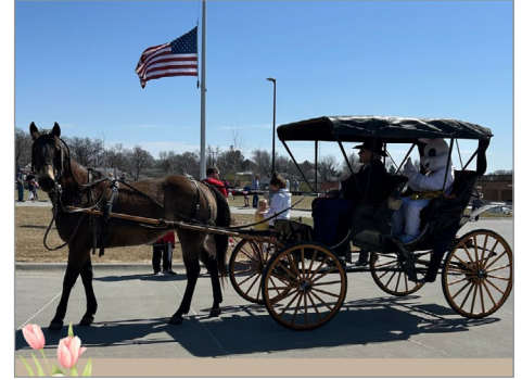
The Easter Bunny arrival to West Point, Neb., in 2025 and by horse and carriage in 2026.

medical appointments and to food service for the delivery of meals on wheels.