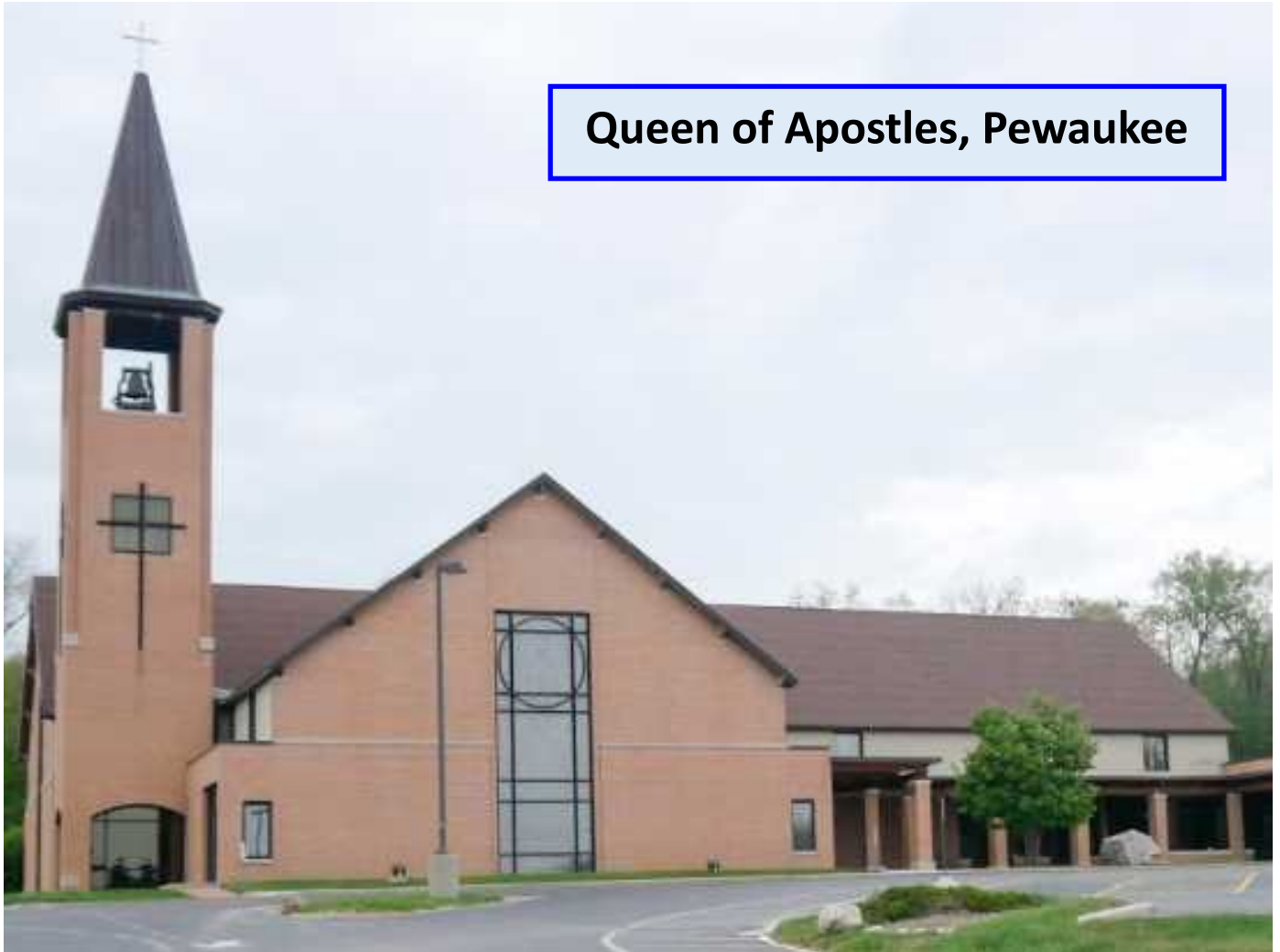
Queen of Apostles, Pewaukee

Let us pray that everyone, from large producers to small consumers, be committed to avoid wasting food, and to ensure that everyone has access to quality food.