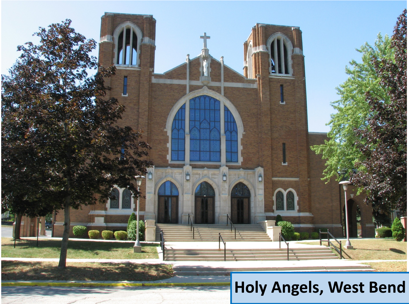
Holy Angels, West Bend

Let us pray that praying with the Word of God be nourishment for our lives and a source of hope in our communities, helping us to build a more fraternal and missionary Church.