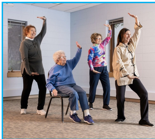
*CFE Tai Chi Class members