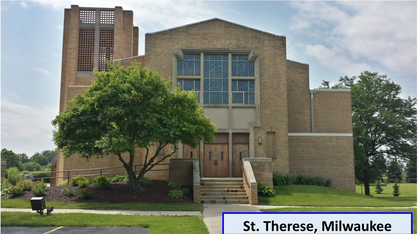
St. Therese, Milwaukee

Let us pray that each one of us might find consolation in a personal relationship with Jesus, and from his Heart, learn to have compassion on the world.