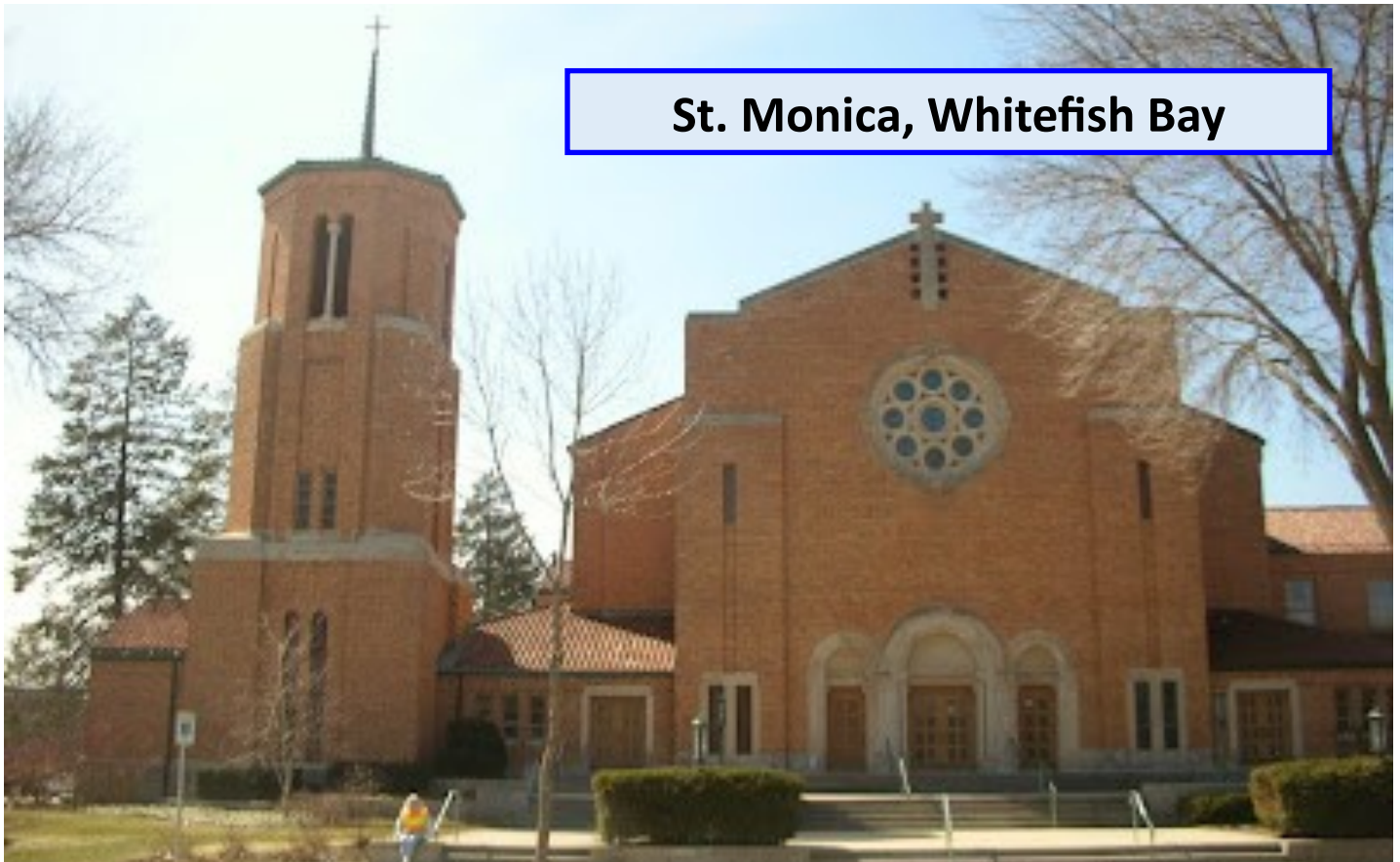
St. Monica, Whitefish Bay

We pray that this Jubilee Year strengthen our faith, helping us to recognize the Risen Christ in our daily lives, and that it may transform us into pilgrims of Christian hope.